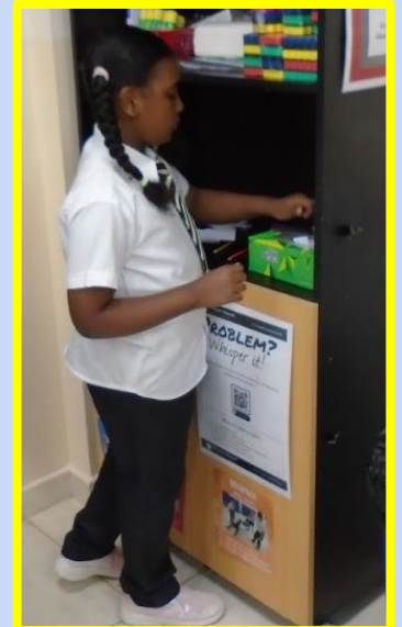
SB have been practicing for their upcoming Assembly!