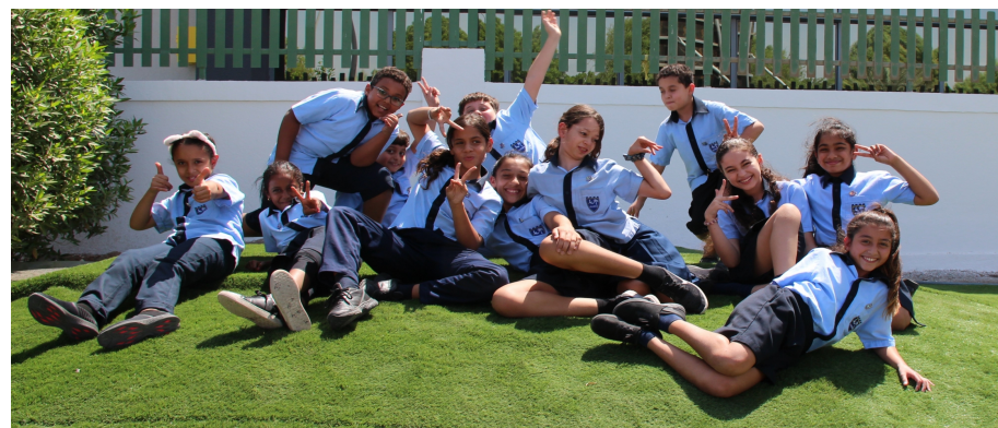
Your 2019-20 House Captains

There are four Houses at our school. The Siger, Stinnes, Cousteau, and Armstrong. If you work hard, show respect, kindness, resilience and empathy, maybe someday you can become a House Captain!