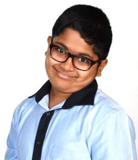
Thinon (Yr 5)