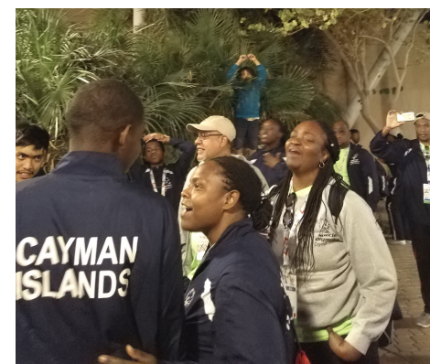
That's me standing with my arms up in front of the tree